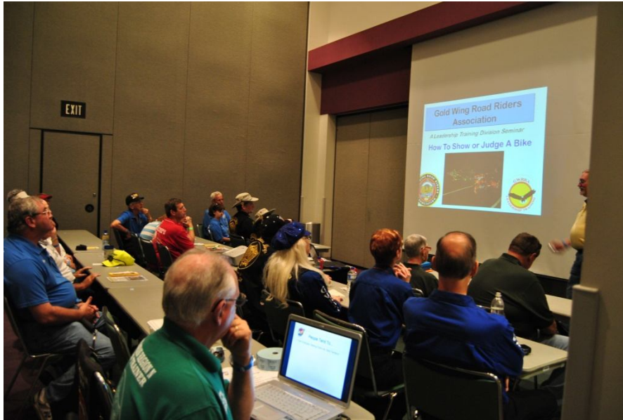
A full class of member participants at the Kentucky Blast 2010, attend the "How to show & Judge a Bike" seminar.